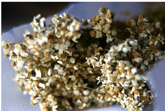
Figure 4 Dried flowering tops of Achillea herba-rotta .

tive). Macerated in alcohol as a digestive. Traded in the past and now (illegally). (CHI-GEM) +++