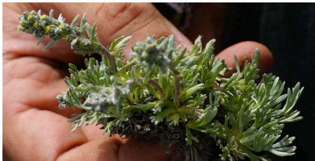
Figure 5 Artemisia genipi .

Boletus spp. (Boletaceae). Wild. Boulet. Fruiting body: consumed (rare). +