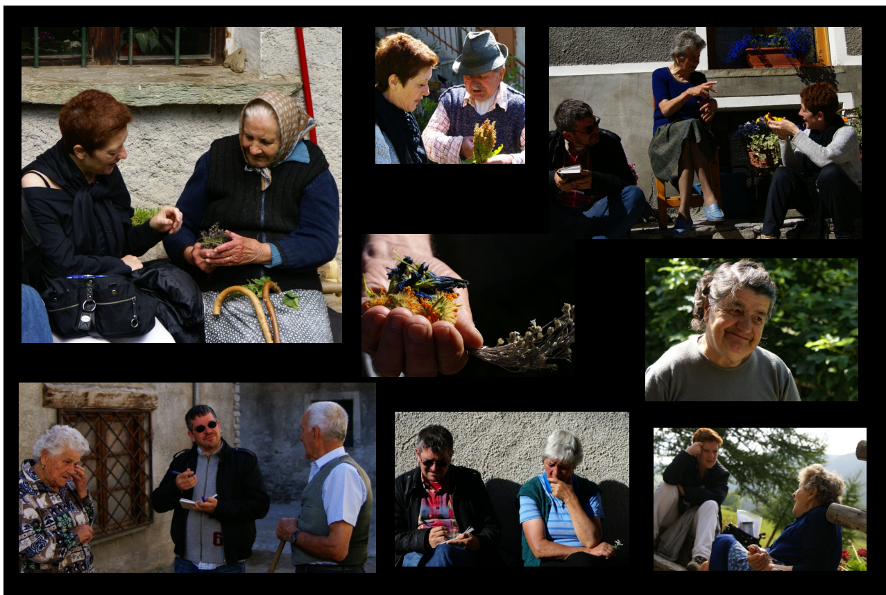
Figure 3 Documentation of a few interviews conducted during the field study (photo: Nicola Robecchi).

(humans) or an anti-diarrheic (cattle). Fresh aerial parts: topically applied as a cicatrizing agent. (CHI-ETA) ++