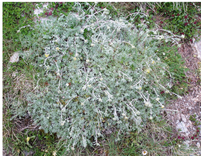
Figure 6 Artemisia glacialis .

Chenopodium bonus-henricus (Chenopodiaceae). Wild. Bies, Zerbes, Orle (plural). Fresh young leaves: consumed boiled in soups and in omelettes. Also preserved in salt. Fodder for cows (reputed to be good as a "cleansing"