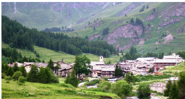
Figure 2 Chianale.

The data collected during the field study were reported using Microsoft® Excel, and a descriptive comparison was conducted with ethnobotanical data available in the scientific literature (e.g. field studies previously conducted in Piedmont and other surrounding alpine areas [15-26]). However, given the tremendous heterogeneity of the methodological approaches adopted in all these previous studies (in which the number of informants was rarely