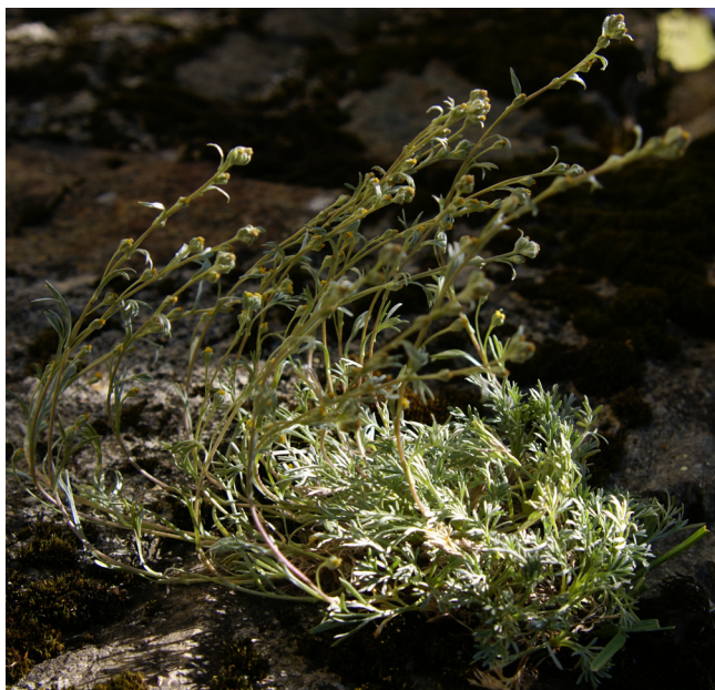
Figure 7 Artemisia umbelliformis .

agent). Topically applied for treating skin inflammation caused by stinging nettle. (CHI-BIE) +++