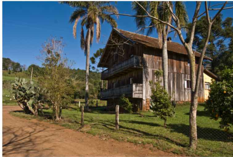
Figure 2 A Tyrolean-style farmer's house in Treze Tílias (Photo: Elisabeth Kuhn).

therefore able to preserve their costumes and language [58-60]. After the road was built, Peruvian settlers moved to Pozuzo, improvements were made to education and the infrastructure, and cattle's breeding was established. Increased migration from other parts of Peru led to decreased use of the German "Tirolese" dialect and more intermarrying between "colonists" and Peruvians. Contact with Tyrol was re-established from the 1930s and intensified from the 1970s, which included ongoing financial assistance from Tyrol and Germany [61]. The district of Pozuzo now has a population of 7,760, of whom just 1,038 live in urban areas [62]. About one third of them are descendents of Tyrolean and German colonists [63]. Farming (mainly cattle) is still hugely important for generating income for the people of Pozuzo. The overall health status of the Peruvian population is