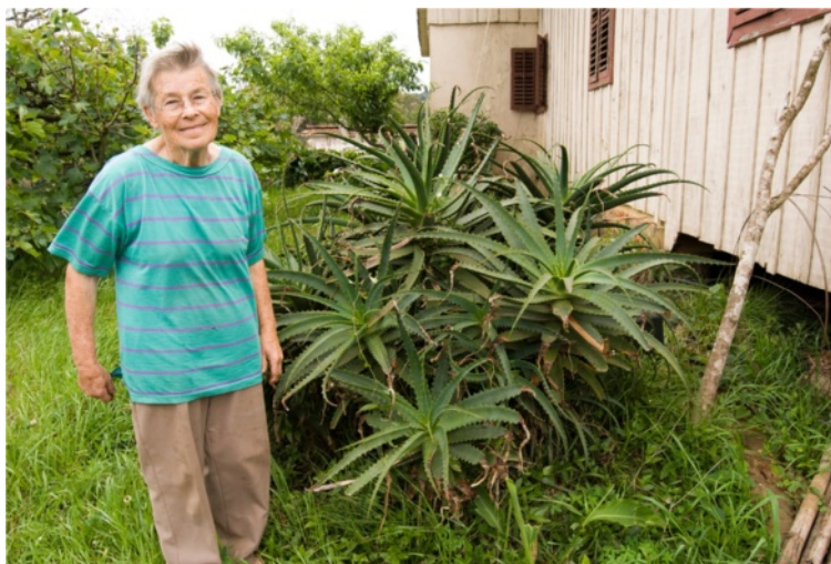
Figure 6 Aloe spp. in the garden of a Tyrolean informant in Treze Tílias.

Artemisia absinthium and the fresh pulp of Aloe spp. (Figure 6) helps overcome digestive discomforts.