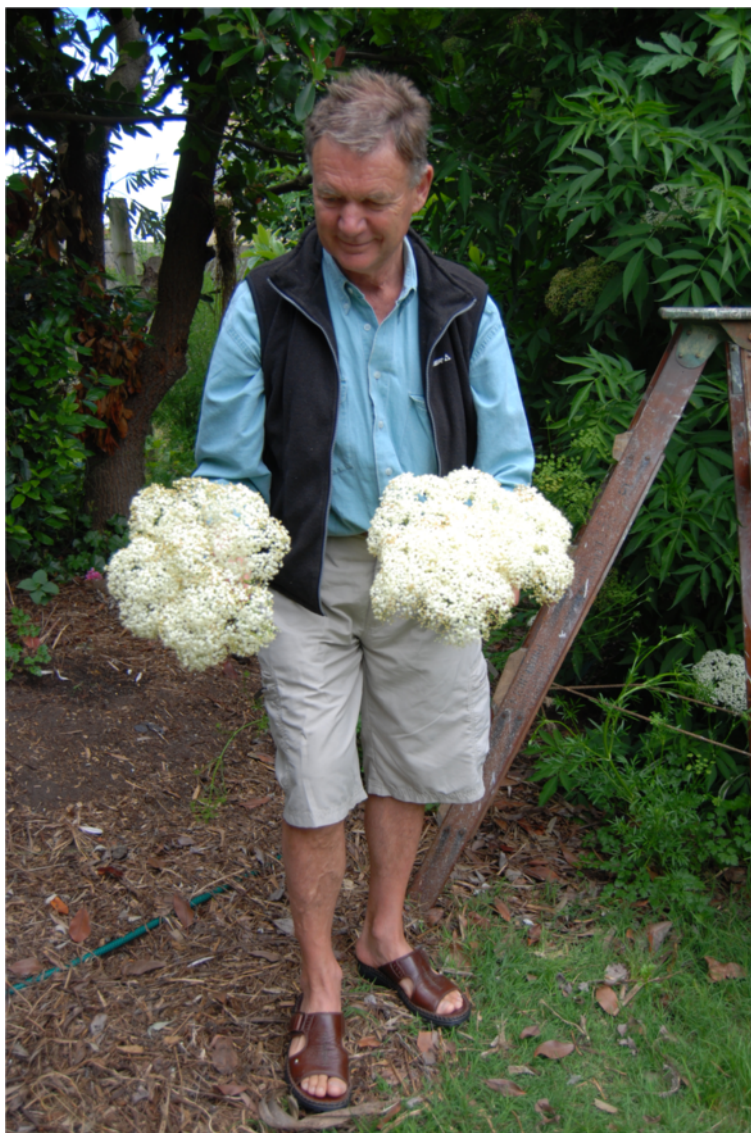
Figure 5 Sambucus nigra in the garden of a Tyrolean informant in Australia.

taxa also had the highest use values (UV) (Table 5). UV ranged from 0.07 to 0.4 (mean = 0.969, stdev = 0.0623, 95% C 0.0837 – 0.1102). Aloe spp. is widely distributed in this area and grows in almost every garden. It is seen as a “universal remedy” among informants. The plant is claimed to cure injuries, burns, wounds, stomach ulcers and digestive problems, as well as prevent cancer. There are many different recipes for its preparation: pulp from the inner leaves is eaten fresh or frozen, and mixed with honey by some informants. Matricaria chamomilla grows in almost every garden and is hardly ever bought in a shop. Achyrocline satureioides (Figure 4) uses are similar to the uses of M. chamomilla (Table 3) although A. satureioides is cited more often in use as a bath additive and for the preparation of tea for young children (Figure 4).