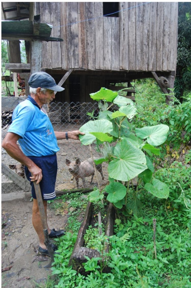
Figure 7 "Santa Maria" ( Piper spp. ) in the garden of a Tyrolean descendant in Pozuzo.

medicinal plant knowledge system. We conclude that the main processes that happened in knowledge transformation in all countries were to abandon specific medicinal plants and related practices from the original pharmacopoeia if the plants were neither available nor cultivated in the country of arrival. The social ties between the relatively low numbers of migrants and their country of origin were not constant and strong enough to offer greater scope for the importation of important plants from the home flora. In conclusion, it can be stated that the choice of medicinal plant use decades after Tyroleans' migration to Australia, Brazil and Peru was greatly influenced by the existing environmental and social conditions in the country of arrival, the predominant healthcare system, the degree of contact