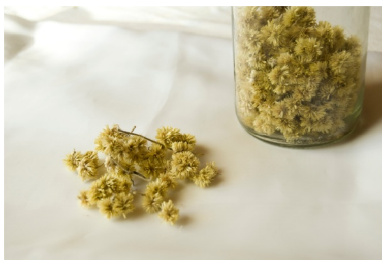
Figure 4 Dried flowers of "Macela" ( Achyrocline satureioides ) collected by a Tyrolean informant (Photo: Elisabeth Kuhn).

Prior to the interviews all informants received formal letters explaining the content of the project and assuring them that any data would be used confidentially. Oral informed consent was obtained from the informants for publication of the collected data and any accompanying images. Successive free lists were accomplished with informants to reveal the local plant names of the area's plants used for medicinal purposes to provide data for further analysis [67,68]. The free-listing question was "Please list