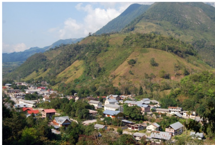
Figure 3 View of Pozuzo.

Since Pozuzian people are quite isolated due to the lack of transport, the first settlers had no medical health care system until the 1940s when the first medical