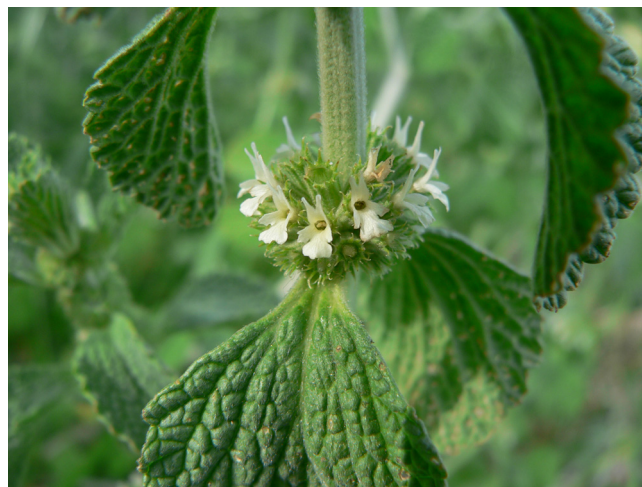
Figure 3 Marrubium vulgare L., one of the most used species in both countries

The Resolution of the World Health Organization issued in 1990 states that " The use done for a long period of time