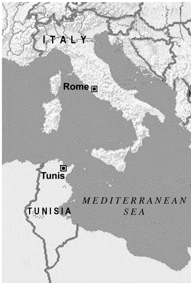
Figure 1 Map of investigated area

In Tunisia, the typical Mediterranean climate which prevails in the Northern and Eastern part of the country collides with the desertic one in the South. In Italy, the climate is generally temperate; although, from North to South, three distinct climatic belts are distinguishable. People living in rural areas have been engaged in agriculture. In the Tunisian villages far from the towns, popular or traditional use of medicinal plants is still familiar to ordinary people. Whilst in Italy, it survives mainly amidst shepherds and older farmers.