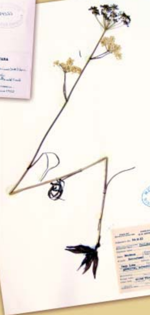
Specimens of chokecherry and yampah from the University of Montana Herbarium.