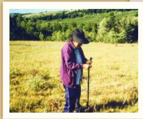
"My grandmother in the field," says LaPier. "We were out collecting Apahsipoko, or alumroot ( Heuchera parvifolia ), in the fall. We dig the whole plant and use the root. [Alumroot] grows in open fields and needs to be past its growing cycle and ready to become dormant. The root is cleaned and the outside layer peeled off. The inner root is laid in the sun to dry. It can then be broken into pieces and boiled like tea, up to three times before you need a new batch. We drink it as a tonic or use it externally as an anti-inflammatory or to dry up wounds."