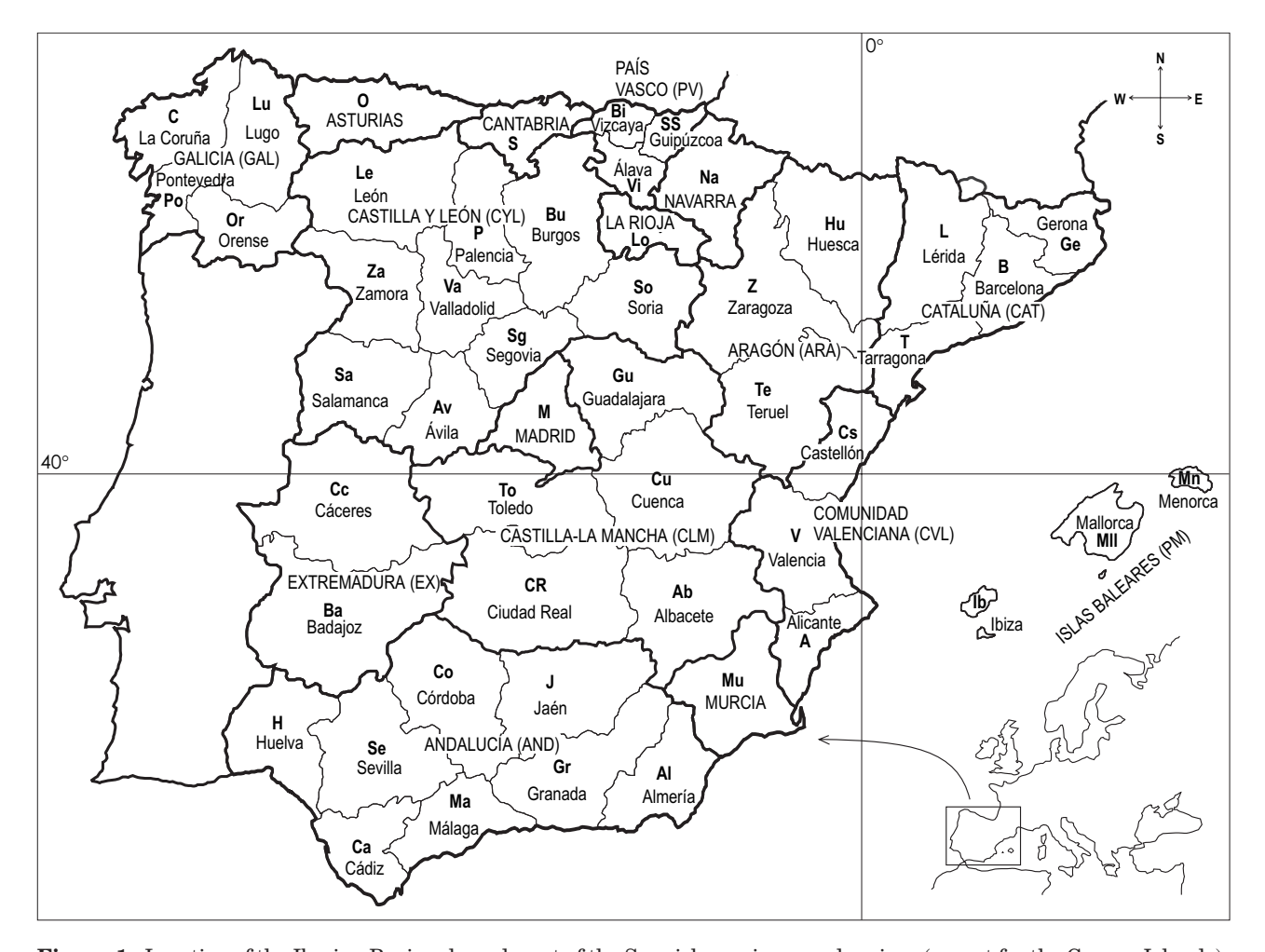
Figure 1. Location of the Iberian Peninsula and most of the Spanish provinces and regions (except for the Canary Islands).

Although most wild species used for food are native plants, introduced species that are now feral were also