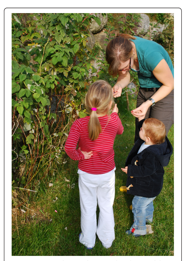
Figure 2 Woman picking raspberries ( Rubus idaeus ) with her children.

The most frequently reported uses of wild gathered plant species, each indicated by more than 90% of the respondents, are Rubus idaeus and Vaccinium myrtillus for food and Matricaria chamomilla and Mentha sp. for drinking (Table 2, Figure 2). More than two-thirds of the respondents (67%–89%) reported the use of Sambucus nigra and Taraxacum officinale agg. for food, the use of Alchemilla alpina , Alchemilla vulgaris , Salvia officinalis and Urtica dioica for drinking, and the use of Arnica montana and Calendula officinalis in human folk medicine. And still mentioned by more than half of the respondents (51%–66%) were the use of Achillea millefolium agg. , Primula sp. , Rhododendron sp. , Rubus idaeus and Sambucus nigra for drinking and the use of