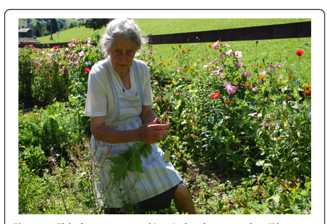
Figure 3 Elderly woman working in her homegarden.

In contrast to that, reports about wild food uses were similar between homegardeners and non-homegardeners,