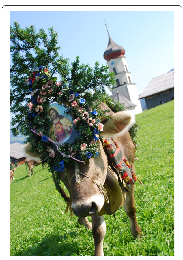
Figure 5 Cow decorated with Picea abies (among others) for the custom of Alpabtrieb (bringing the livestock down fromthe alpine pastures).

The plant species less known as used by farmers are especially Rhododendron sp. (reported by 21% of nonfarmers and 14% of farmers) and Abies alba/Picea abies (reported by 18% of non-farmers and 12% of farmers) (see Additional file 1). Both plant species are well known